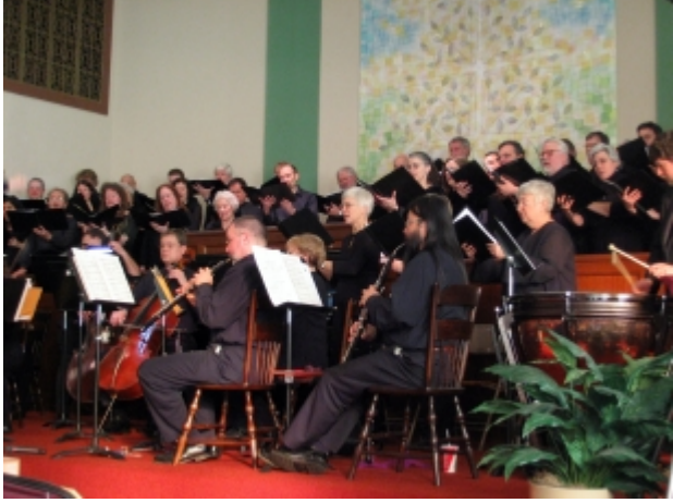
The Bach Cantata Choir and Orchestra pull out all the stops for the Festival Cantatas at the February 2, 2008 concert.