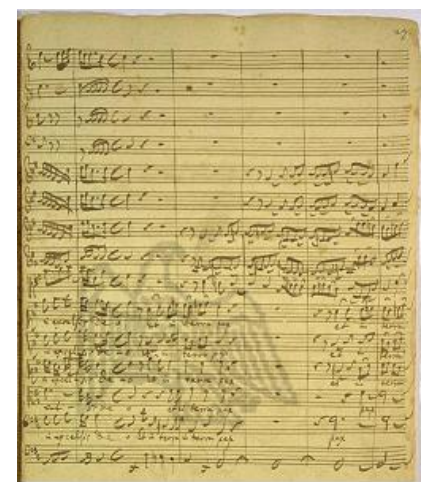
A page of the "Gloria" from B-Minor Mass.

argued that all possible human emotions could be condensed into "six simple and primitive passions, i.e., wonder, love, hatred, desire, joy, and sadness. All the others are composed of these six, or are species of them." Descartes' systematization was later applied directly to music theory by contemporaries of Bach, where it was argued that, in order to convey the relevant emotions, "music,